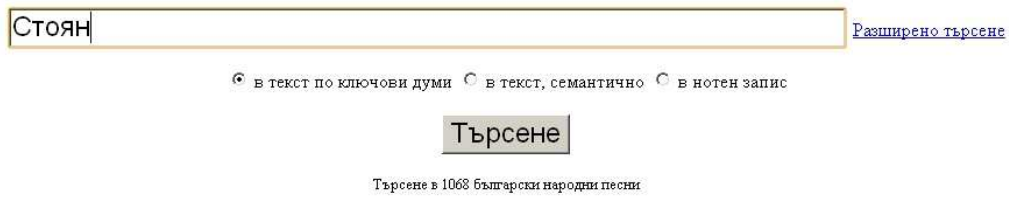
Figure 1: Web interface for searching in the library